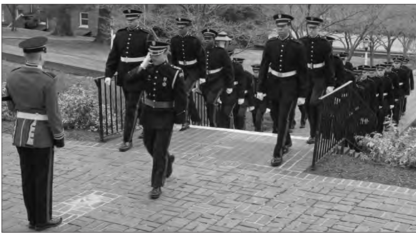
College cadets march into chapel. The whole day's event was filled with precision marching by the students.