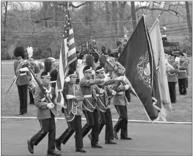
Flags pass in review.

1812 PA went to Valley Forge Military Academy and College in April for church service, parade, and lunch. During the service we presented our ROTC award for 2011.